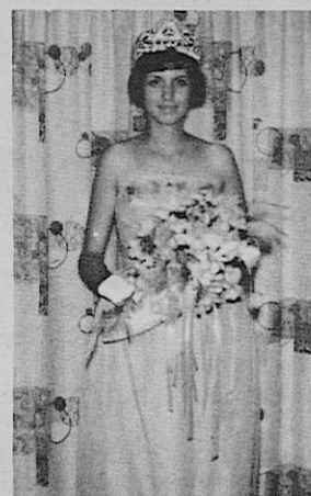
BELOVED QUEEN GEORGIANNA SHIELD INVITES YOU